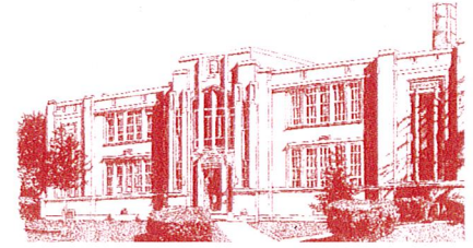
ELEMENTARY SCHOOL (315) 683-5857