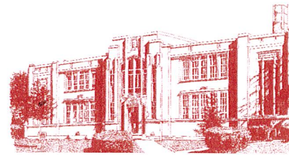
ELEMENTARY SCHOOL (315) 683-5857