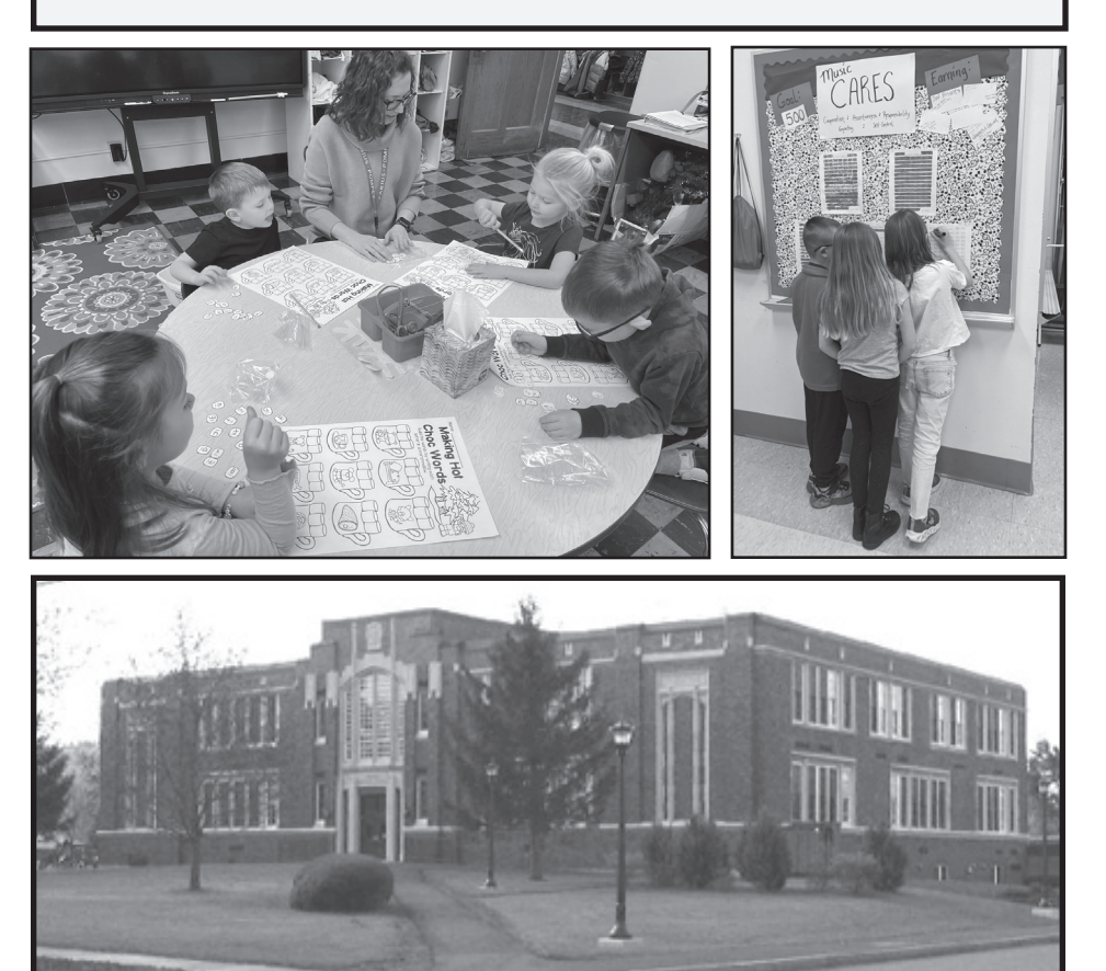
Fabius-Pompey Central School District Newsletter