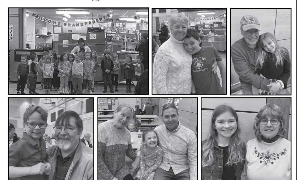
Fabius-Pompey Central School District Newsletter