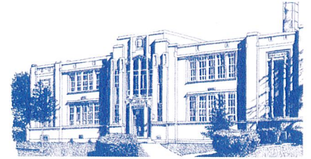
ELEMENTARY SCHOOL (315) 683-5857