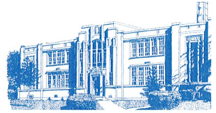
ELEMENTARY SCHOOL (315) 683-5857